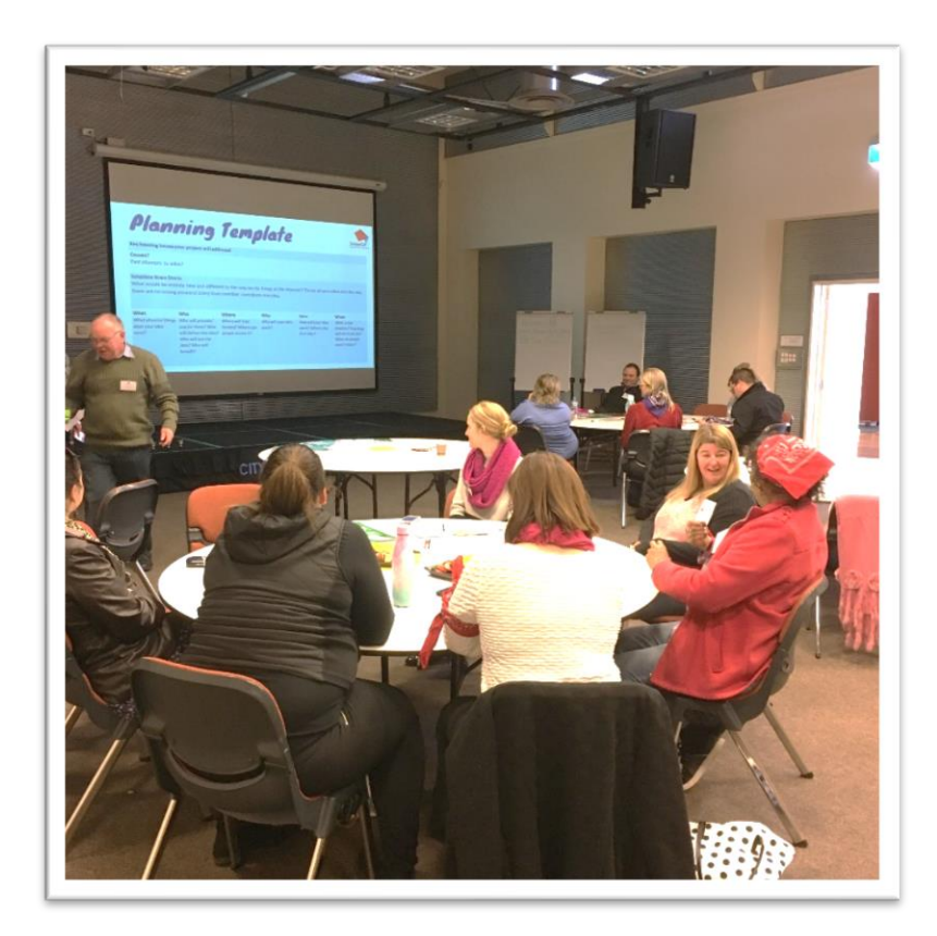
Workshop attendees discuss their planning templates